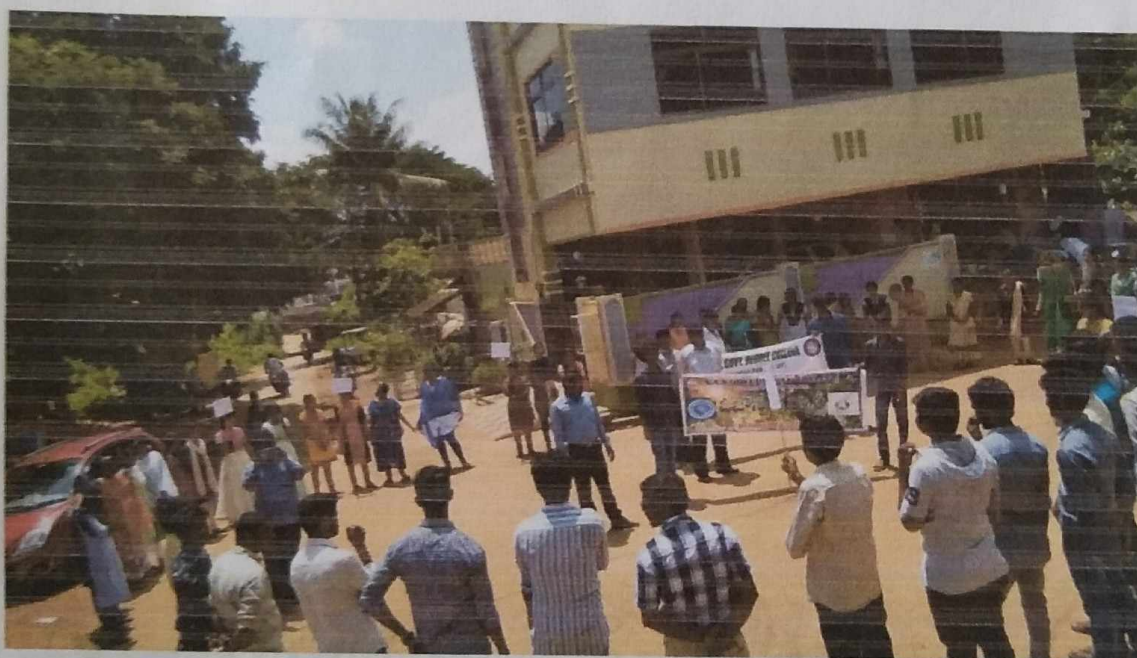
AWARENESS PROGRAM ON THE PROTECTION OF OZONE LAYER THROUGH HUMAN CHAIN ON 16-09-2018.