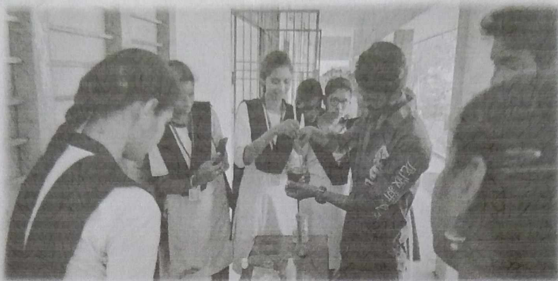
DEMONSTRATION OF CHEMISTRY EXPERIMENTS TO THE NON- CHEMISTRY STUDENTS ON THE OCCASION OF NATIONAL SCIENCE DAY 28-02-2019.