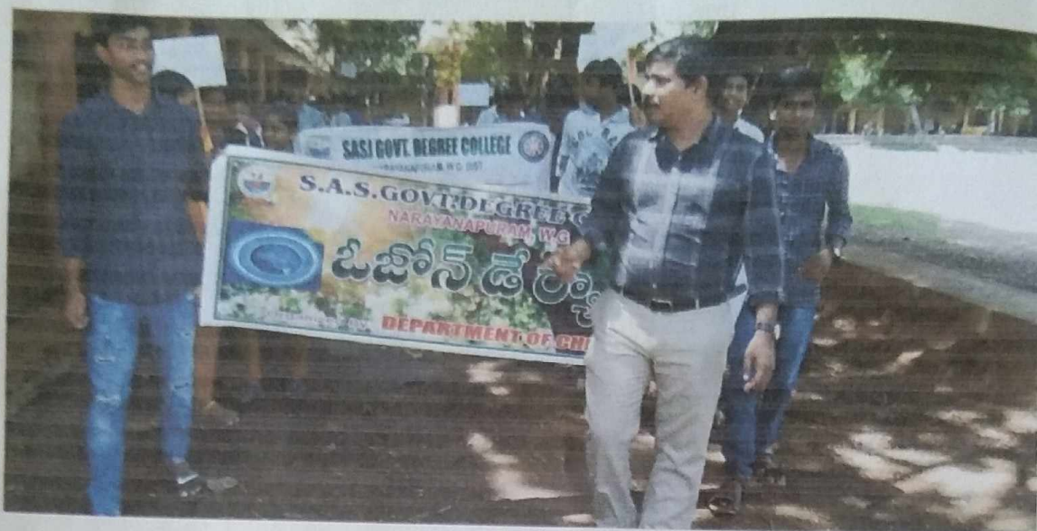
AWARENESS RALLY ON THE PROTECTION OF OZONE LAYER BY THE COLLEGE STAFF AND STUDENTS ON THE OCCASION OF OZONE DAY 16-09-2018.