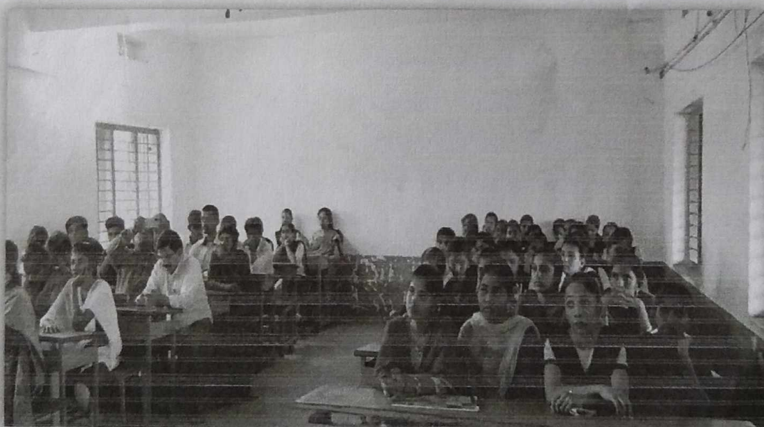
STUDENT AND TEACHER PARTICIPANTS ATTENDING SPECIAL TALK ON EVERYDAY CHEMISTRY ON THE OCCASION OF NATIONAL SCIENCE DAY 28-02-2019.